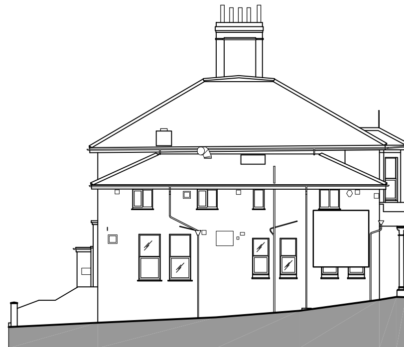
EXISTING CAR PARK SIDE ELEVATION