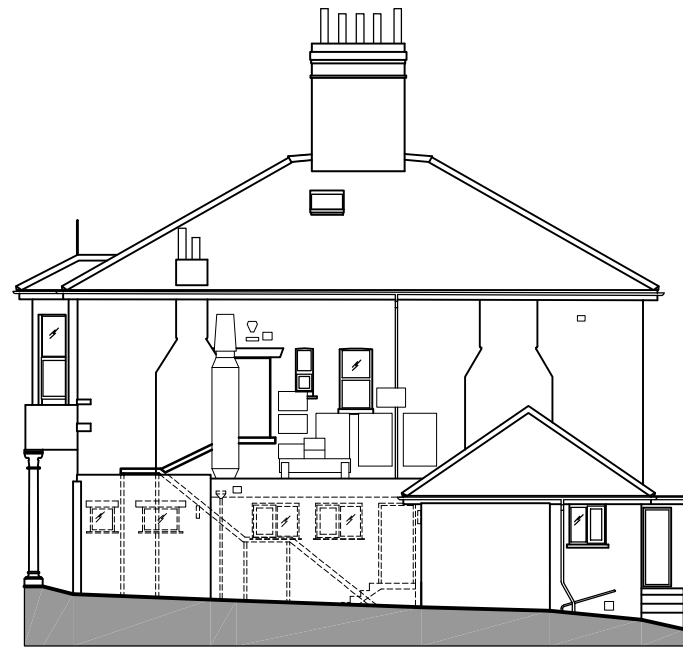
EXISTING COOL OAK LANE ELEVATION